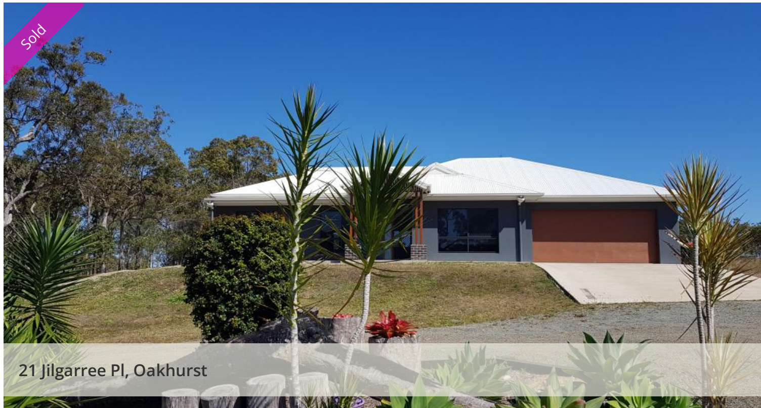
21 Jilgarree Pl, Oakhurst