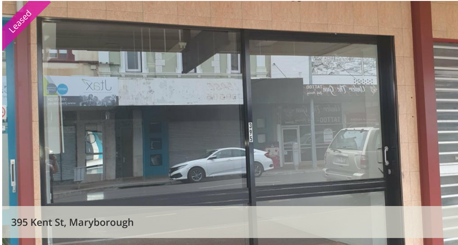
395 Kent St, Maryborough