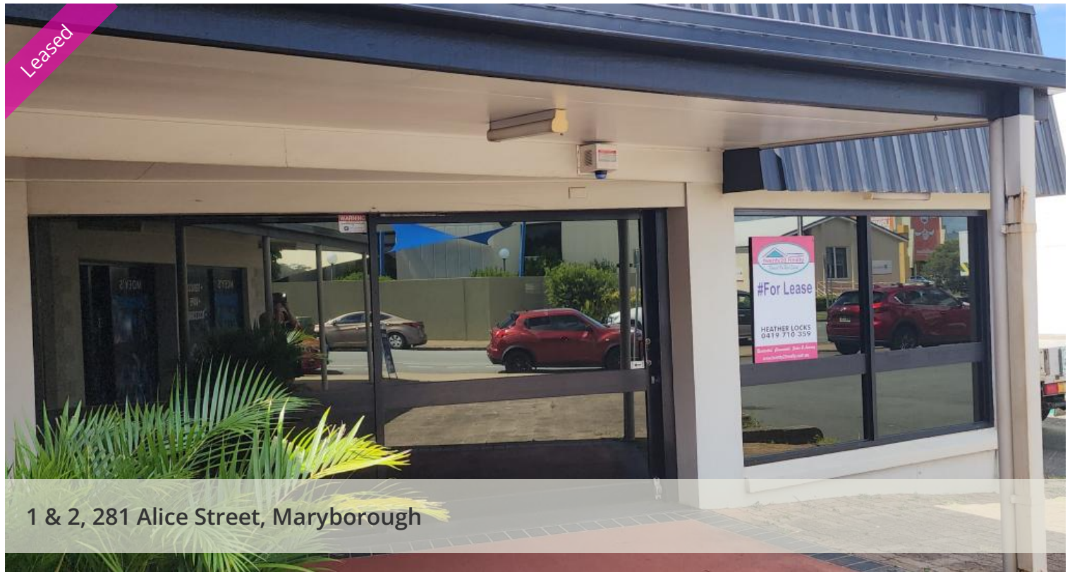
1 & 2, 281 Alice Street, Maryborough