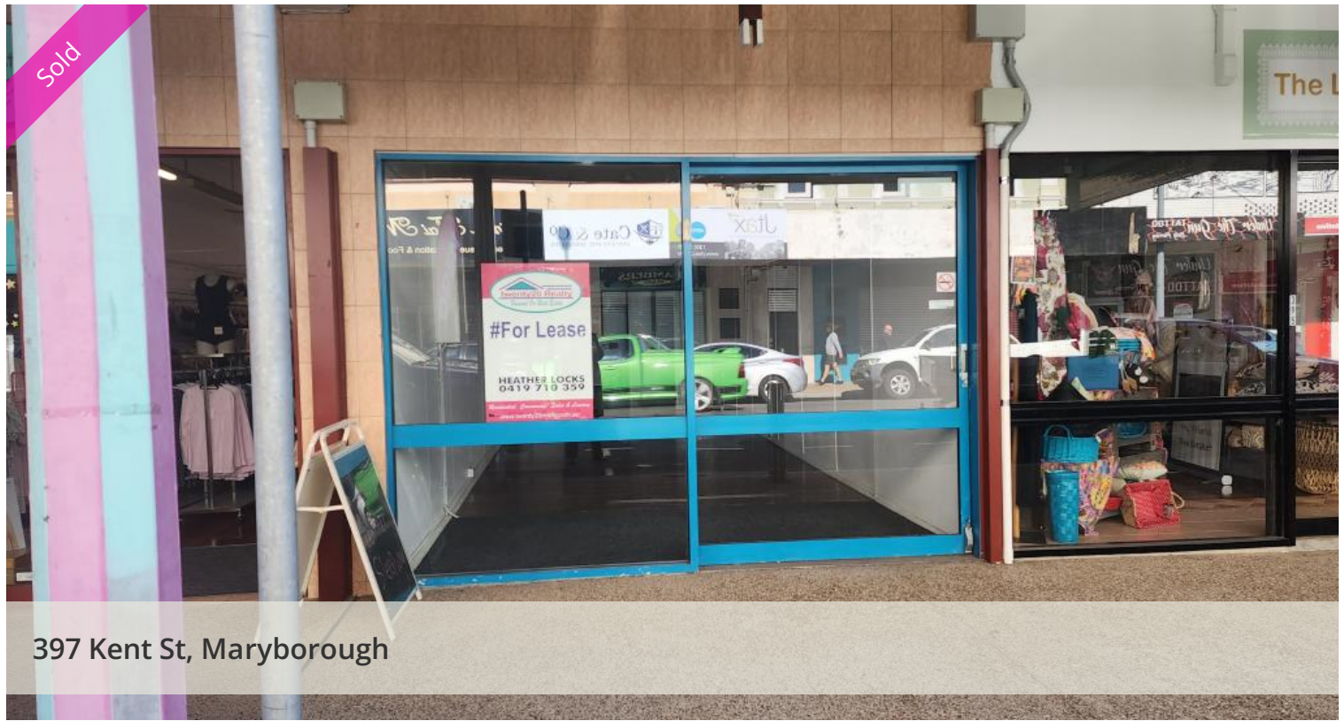
397 Kent St, Maryborough