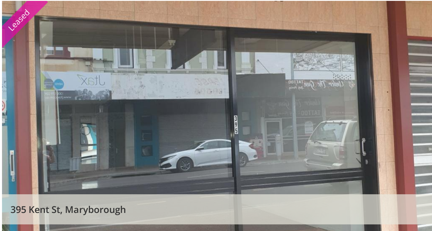
395 Kent St, Maryborough