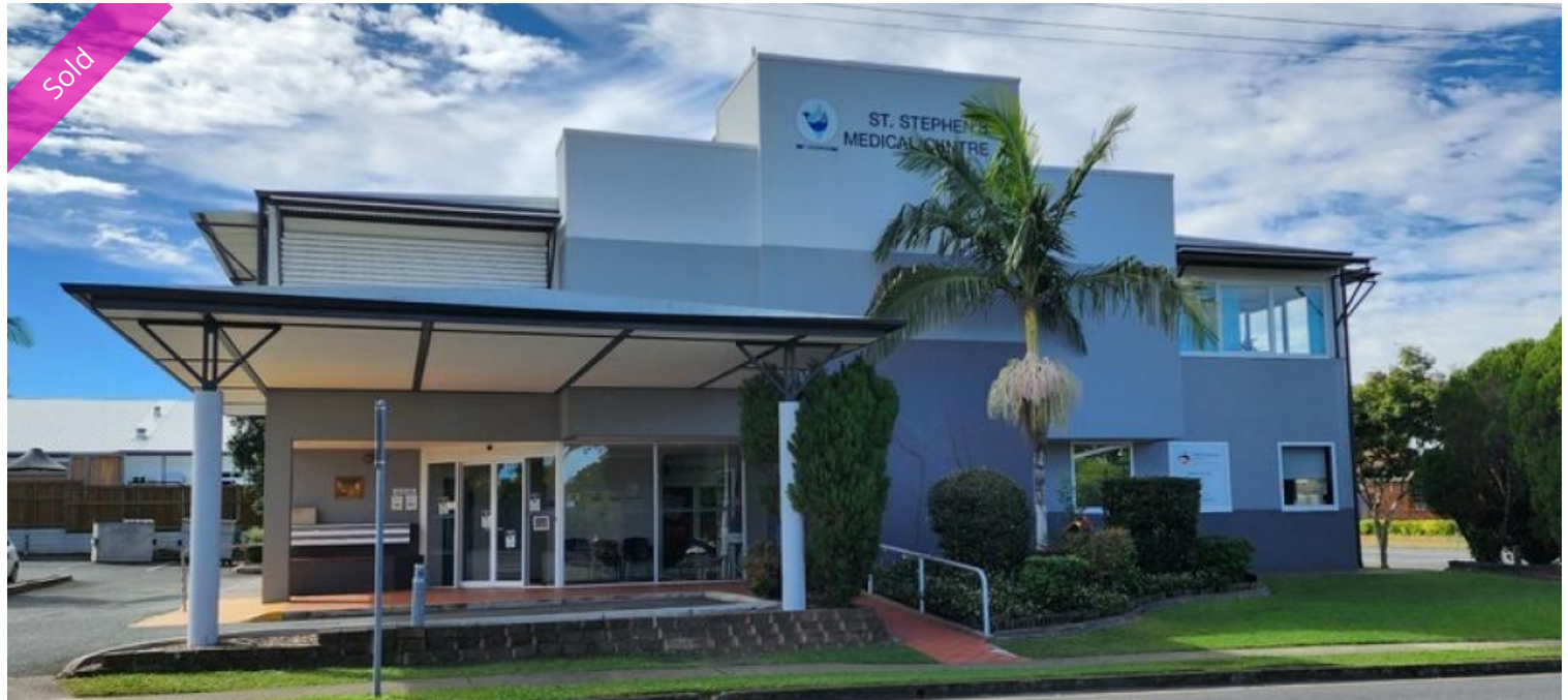
Unit 5, 166 John St, Maryborough