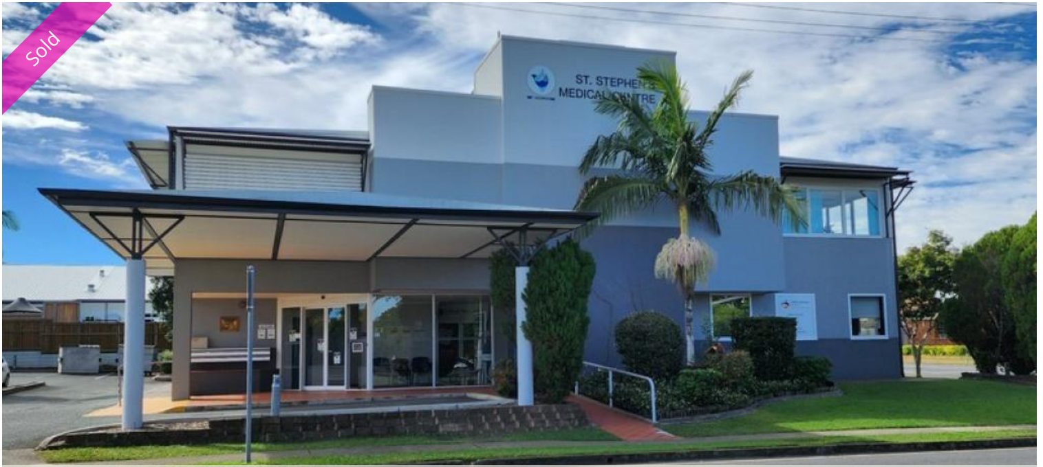
Unit 5, 166 John St, Maryborough